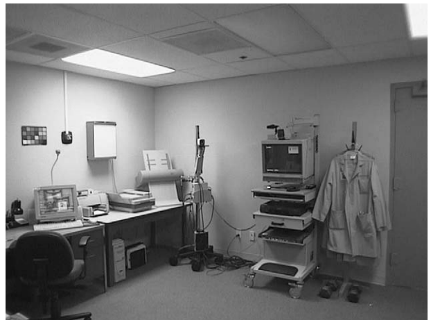
Figure 3 A typical telemedicine room used for clinical videoconferencing, store-and-forward applications, educational broadcasts and administrative meetings

conversations and consultations via videoconference. One is the colour of the room. The first telemedicine equipment installed by the ATP in Tuba City, Arizona, was in a room that had been painted a striking shade of pumpkin-orange. This did not photograph well and typically distorted the skin colour of those being