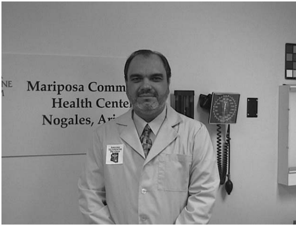
Figure 4 A typical telemedicine room showing a clinician with the site identification sign behind him

convinced the relevant authorities that a light blue colour should be used for the walls in their telemedicine rooms. The biggest challenge in fulfilling our request has been to obtain a matt paint. Institutions prefer semi-gloss paint because of its shine and ease of cleaning, but cameras do not, because of the inherent glare.