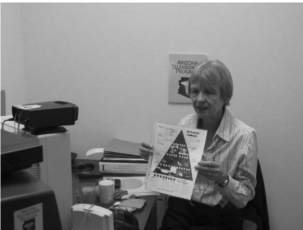
Figure 2 The nutrition specialist at the St Elizabeth's of Hungary Clinic in Tucson, Arizona, giving a lecture from the telemedicine room. Note the relatively small workspace she has available