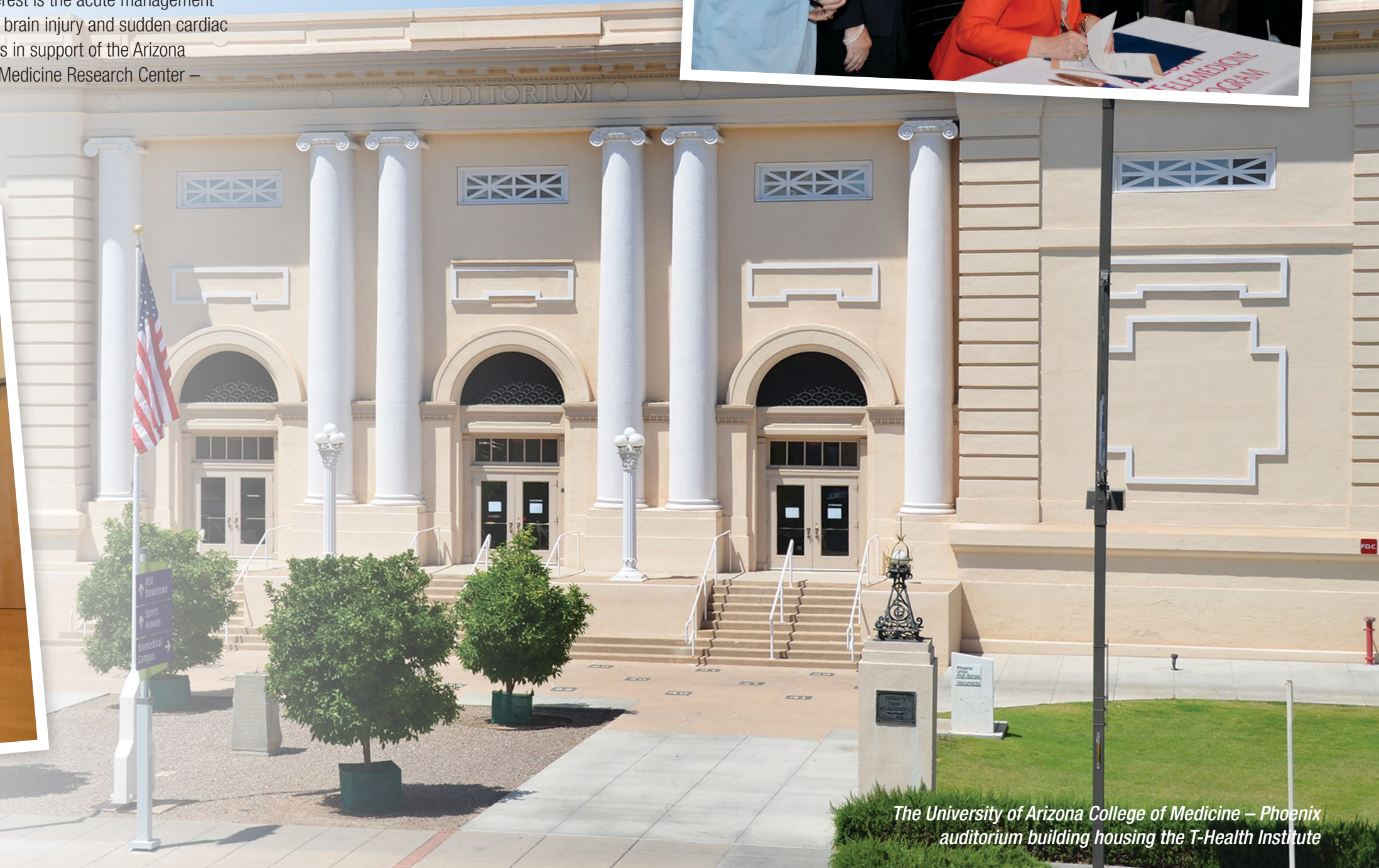
The University of Arizona College of Medicine – Phoenix auditorium building housing the T-Health Institute