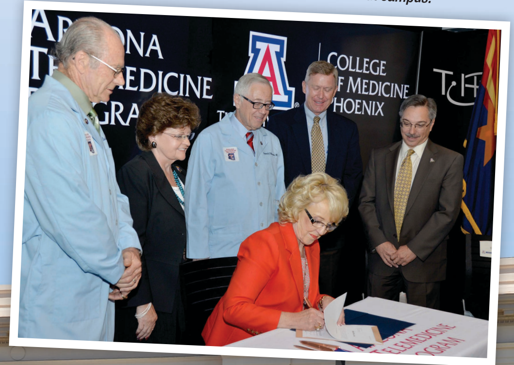
Governor's ceremonial signing of Senate Bill 1353 in the T-Health Amphitheater on the University of Arizona College of Medicine – Phoenix campus.