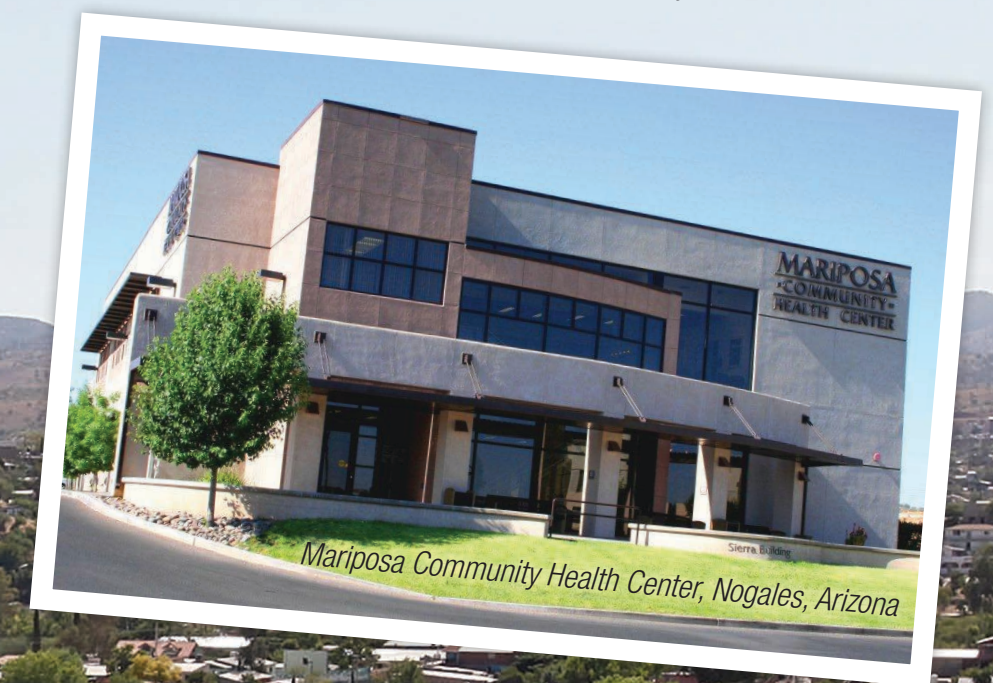
Mariposa Community Health Center, Nogales, Arizona

"But regardless of how the technology changes in the future, historically telemedicine has meant a lot to our providers and to the patients. It was absolutely a win-win."