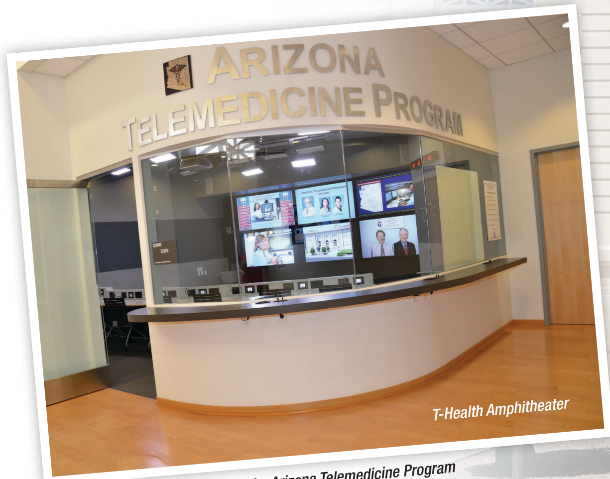
T-Health Institute – a Division of the Arizona Telemedicine Program