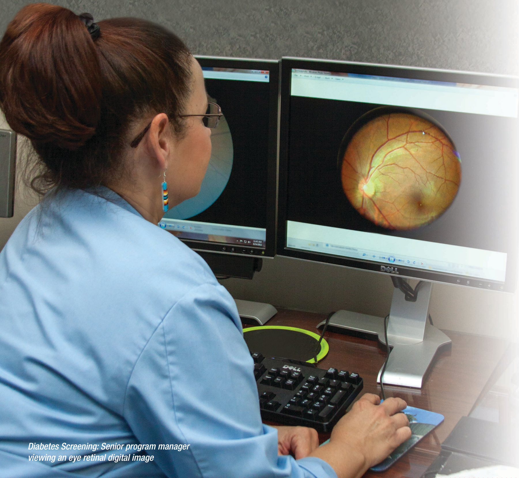
Diabetes Screening: Senior program manager viewing an eye retinal digital image

Diabetes is epidemic among Native Americans. But thousands now receive annual eye exams, reducing their risk of diabetes-related blindness, through the Indian Health Service's multi-state teleophthalmology program.