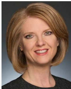
Heather Carter, EdD Senator Arizona State Senate, Legislative District 15