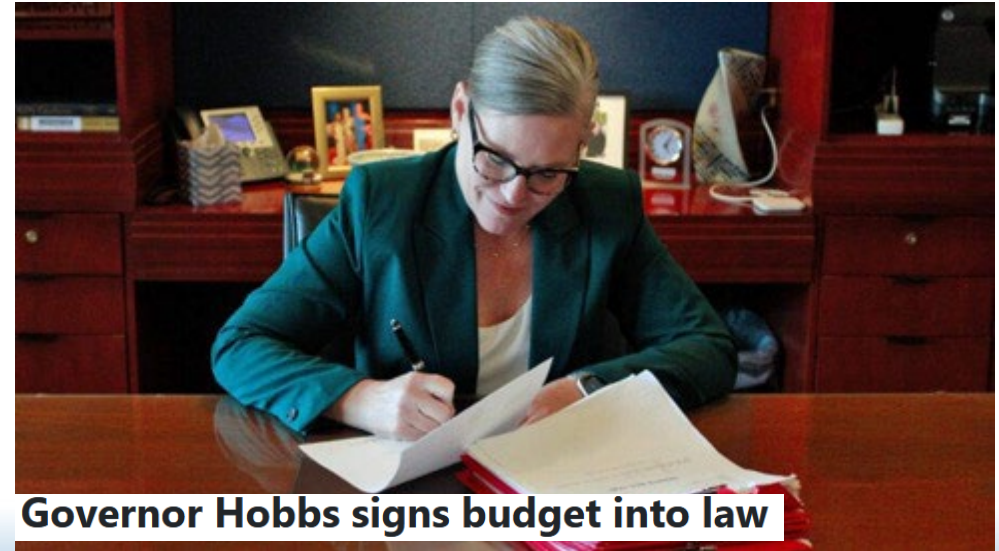
Governor Hobbs signs budget into law

Support, expand primary care GME in rural areas and health professional shortage areas (HPSAs).